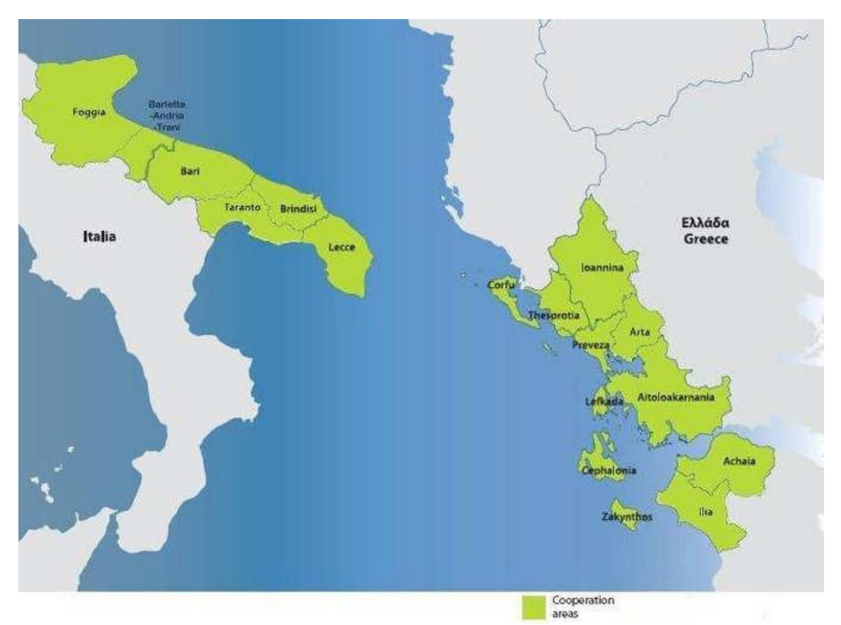
Table 1: Eligible GR-IT Co-operation Programme Area